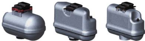
FLUSHMATE® II 501-B FLUSHMATE® III 503 FLUSHMATE® IV 504**

INTELLI-Flush* is ready to install on any of the following series: