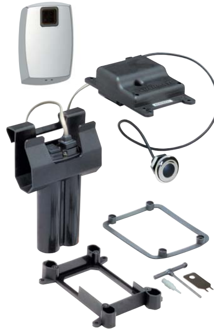
ON WALL SENSOR