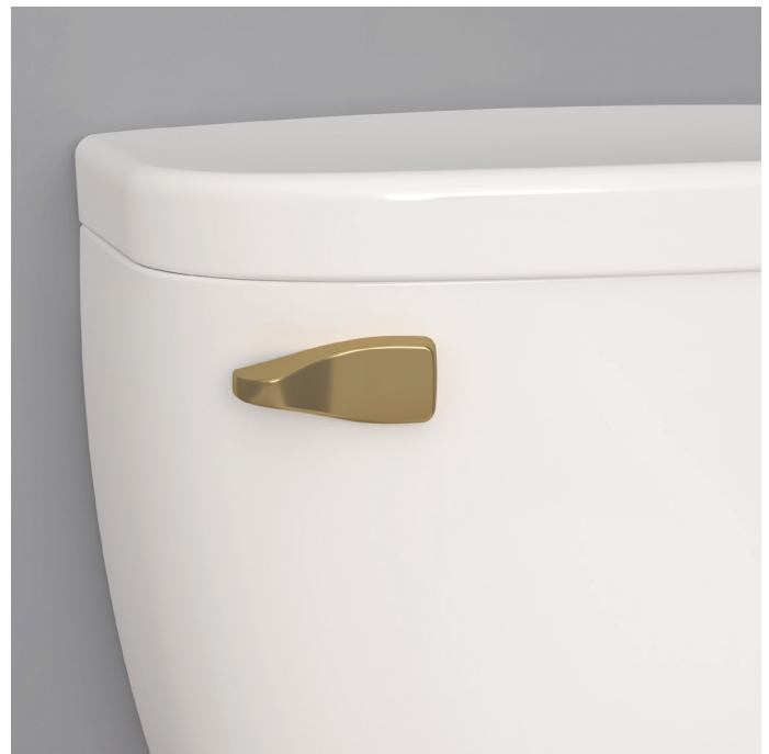
The Universal Handle Kit comes with everything needed for your Flushmate-equipped toilets and is available in Chrome, Satin Nickel, Polished Nickel, and Polished Brass (shown), to match your project.

To learn more visit flushmate.com/universal-handle-kits