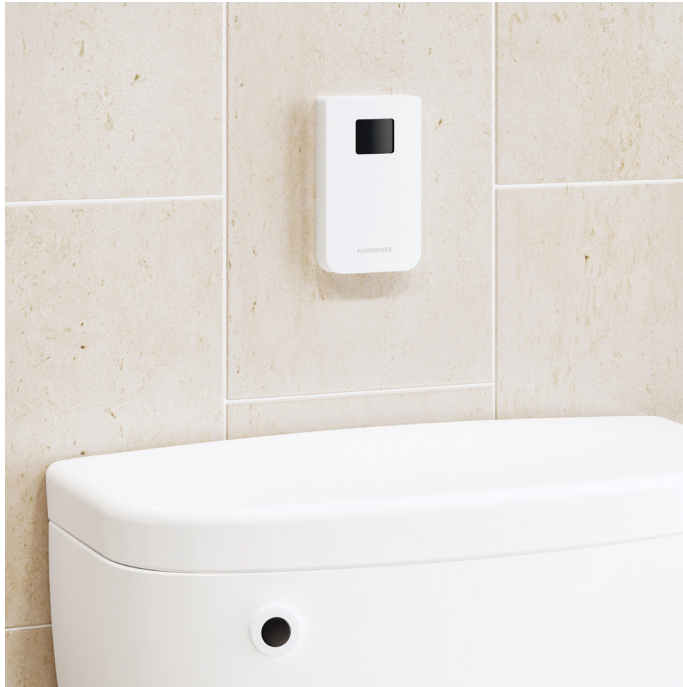
The I-Flush is available in white (shown) and chrome finishes with matching push buttons.